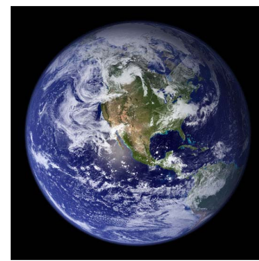
The new technology will also be used on Earth to provide important data in studies ranging from climate and atmospheric science to biohazard detection.

In addition to planetary mapping, imaging LIDAR detectors will have uses on Earth. Other applications include remote sensing of the atmosphere for both climate studies and weather forecasting, topographical mapping, biohazard detection, autonomous vehicle navigation, battlefield friend/foe identification and missile tracking, to name a few.